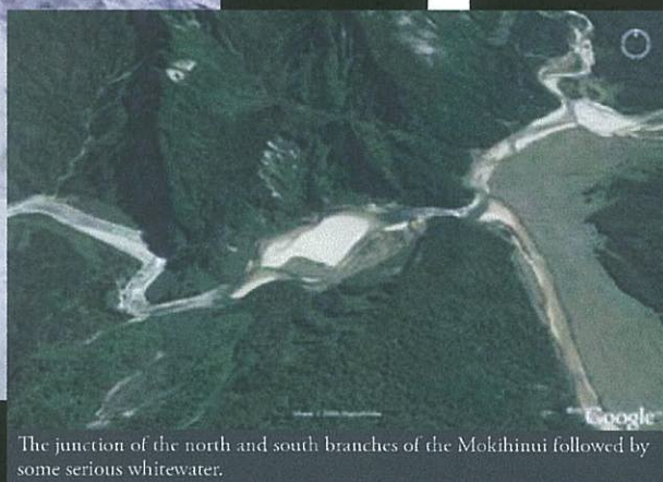
The junction of the north and south branches of the Mokihinui followed by some serious whitewater.

Operator: Eco-rafting, www.ecorafting.co.nz , 0508 669 675