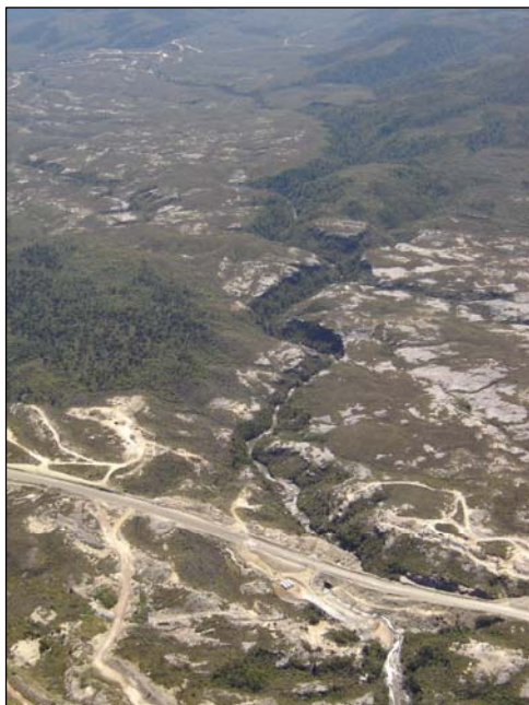
Figure 1 Aerial Photograph of Lower Mangatini Sub-Catchment

The Mangatini Stream is currently dosed with lime by Solid Energy in an effort to improve water quality, by raising the pH in the Lower Mangatini Stream.