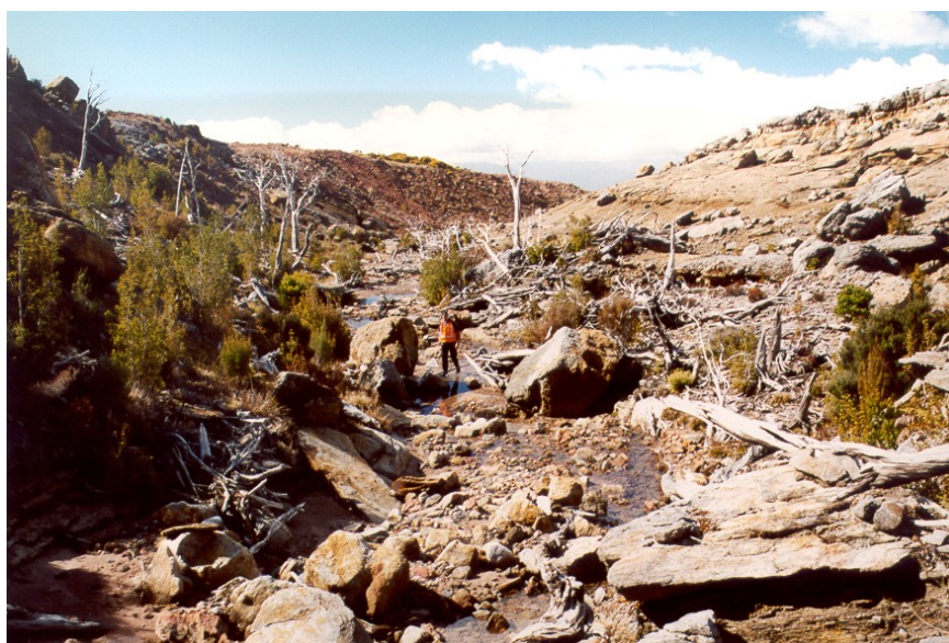
Figure 2 Photograph of the Headwaters of Mine Creek

The Mine Creek sub-catchment is located to the north of the Mangatini Stream sub-catchment. The tributaries of Mine Creek collect water from the northern part of the Stockton Plateau. Mine Creek flows generally in a northern direction, under Stockton Road towards a confluence with the Ngakawau River. The Mine Creek sub-catchment comprises an area of approximately 960ha.