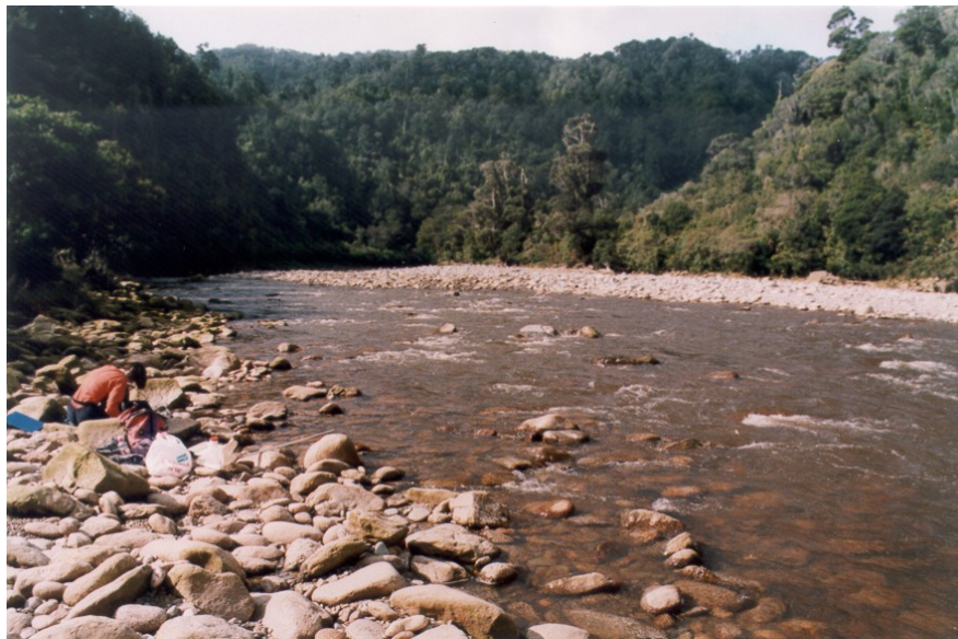
Figure 3 Photograph of the Ngakawau River above the Mine Creek Confluence

Boulders, ranging from 50 % at the most upstream site to 80 % at the second most upstream site, dominated the riffle substrate of the Ngakawau River. Large and small cobbles make up most of the remaining substrate at these sites, with the lowest site having the finest substrate. At the confluence, small cobbles and gravels dominate the substrate (30 % each), followed by boulders and large cobbles (15 % each) (NIWA, 2001).