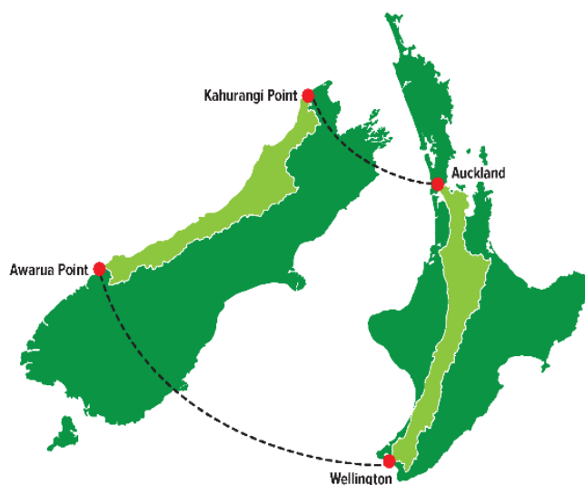
The West Coast region stretches the equivalent distance of that between Auckland and Wellington

Our region has one regional council – the West Coast Regional Council – and three district councils: Buller, Grey and Westland.