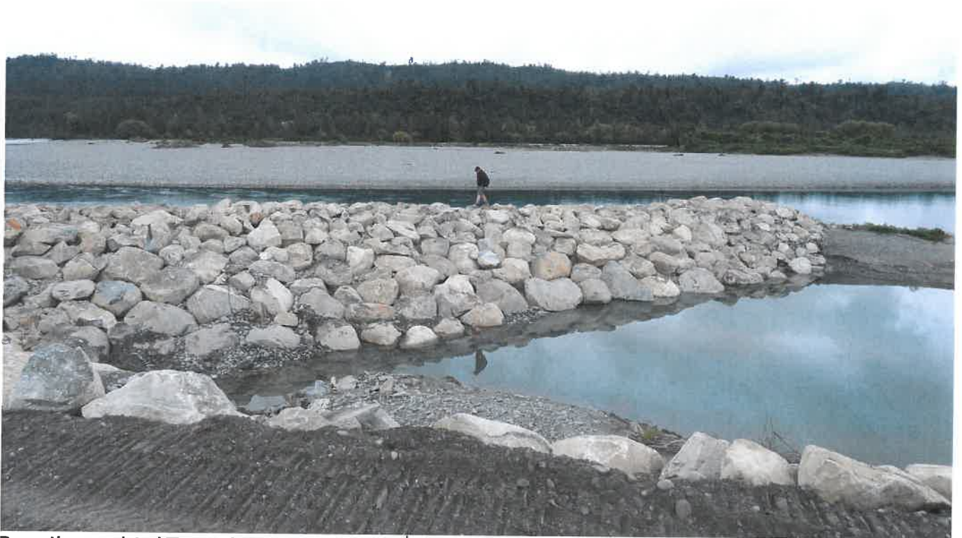
Recently completed Taramakau Rating District 3 rd Rock Retard – 24 March 2013