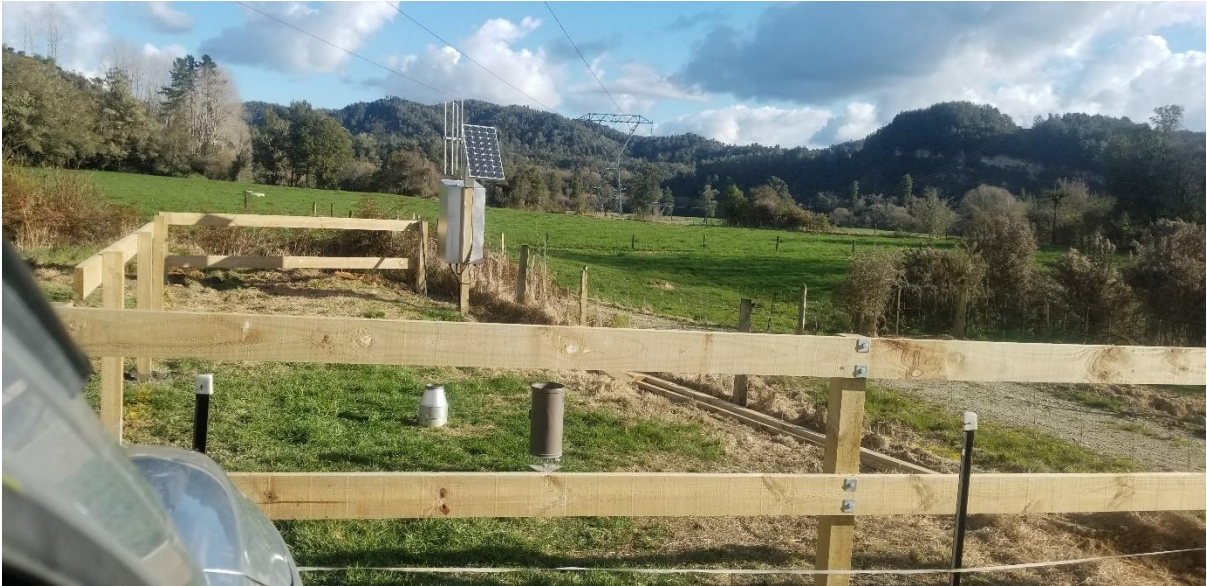
Figure 1: Near completed timber fence at site Buller Rv @ Three Channel Flat.