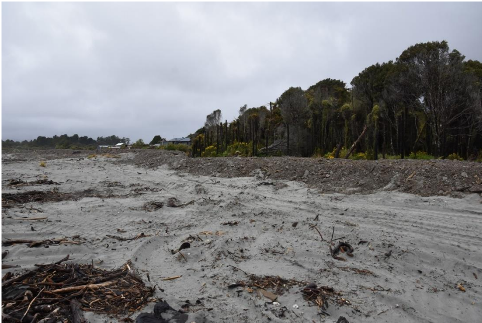
Sacrificial Bund – Looking towards Neil's Beach