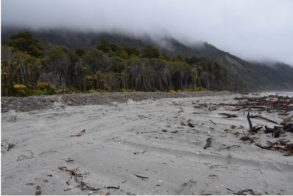
Sacrificial Bund – Looking towards Jacksons Bay