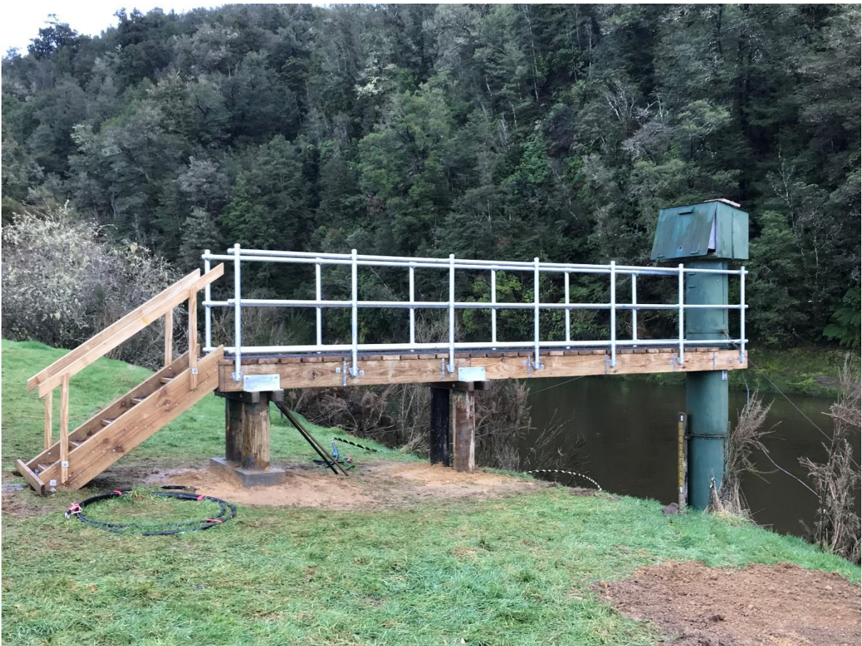
Figure 2: Near completed upgraded catwalk at site Inangahua Rv @ Landing.