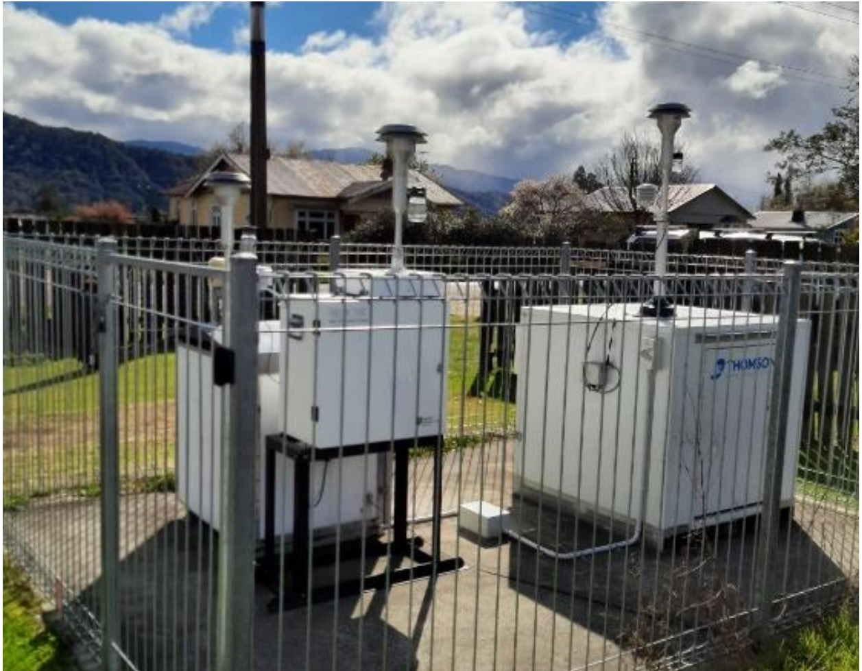
Figure 2. Reefton air quality monitoring instruments. From left to right; BAM, Partisol, and T640X.

Work has begun with NIWA to analyse the data collected from the Partisol during winter. This work is funded by the Envirolink grant and will help to better understand the relationship between the BAM and the T640X. The Partisol is located directly between the two existing instruments, as seen below in Figure 2.