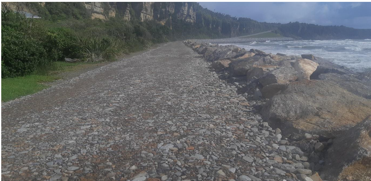
Compacted material, looking south along crest

MBD Contracting Ltd have placed 252 tonnes of rock on the Punakaiki Seawall. The rock was sourced from the Whitehorse stockpile and was used to fill some voids in the sea-side face of the wall. While on-site the contractors also placed and compacted 360 tonnes of gravel from Fagan's Creek to rebuild the crest of the seawall.