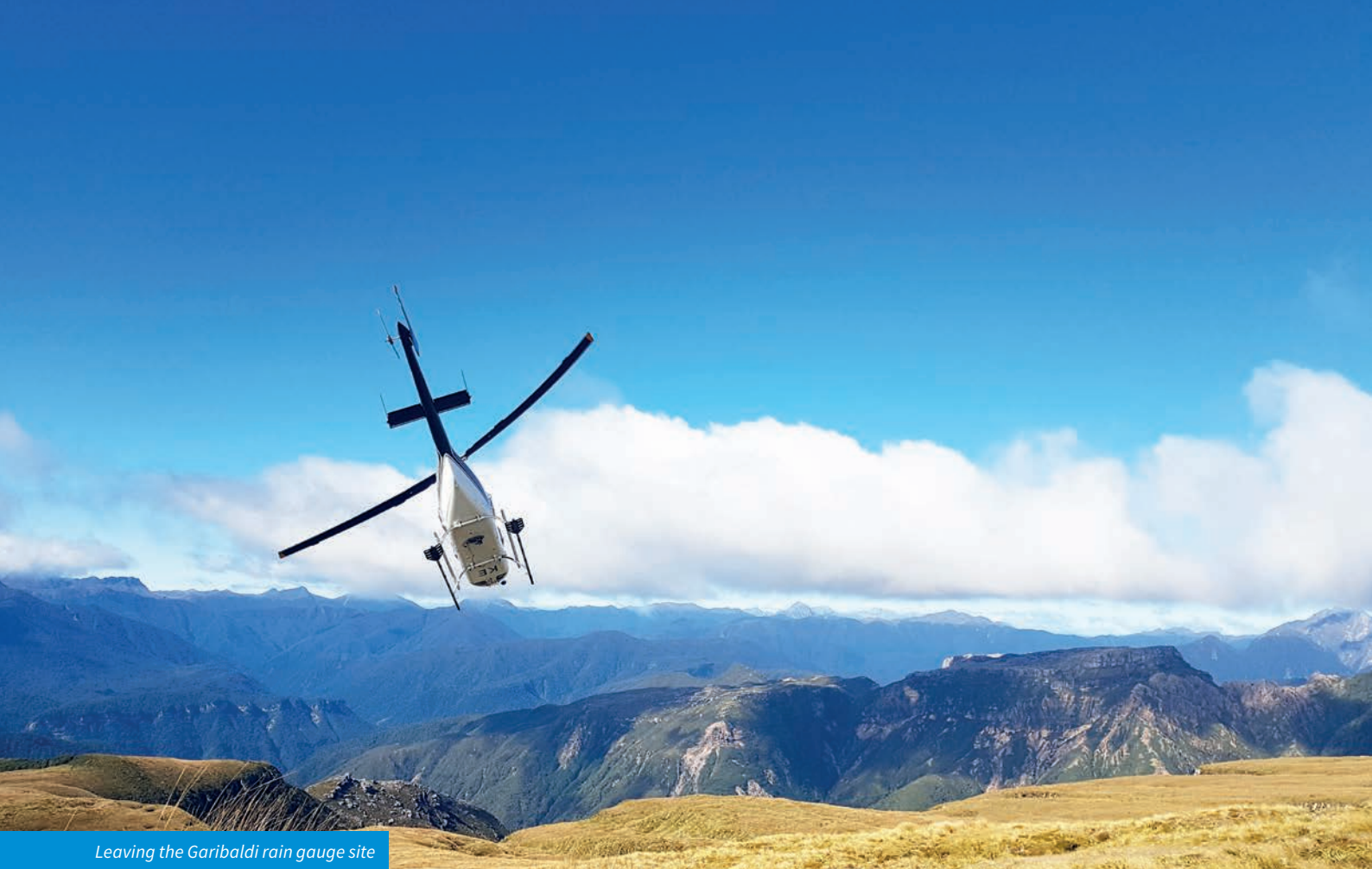
Leaving the Garibaldi rain gauge site