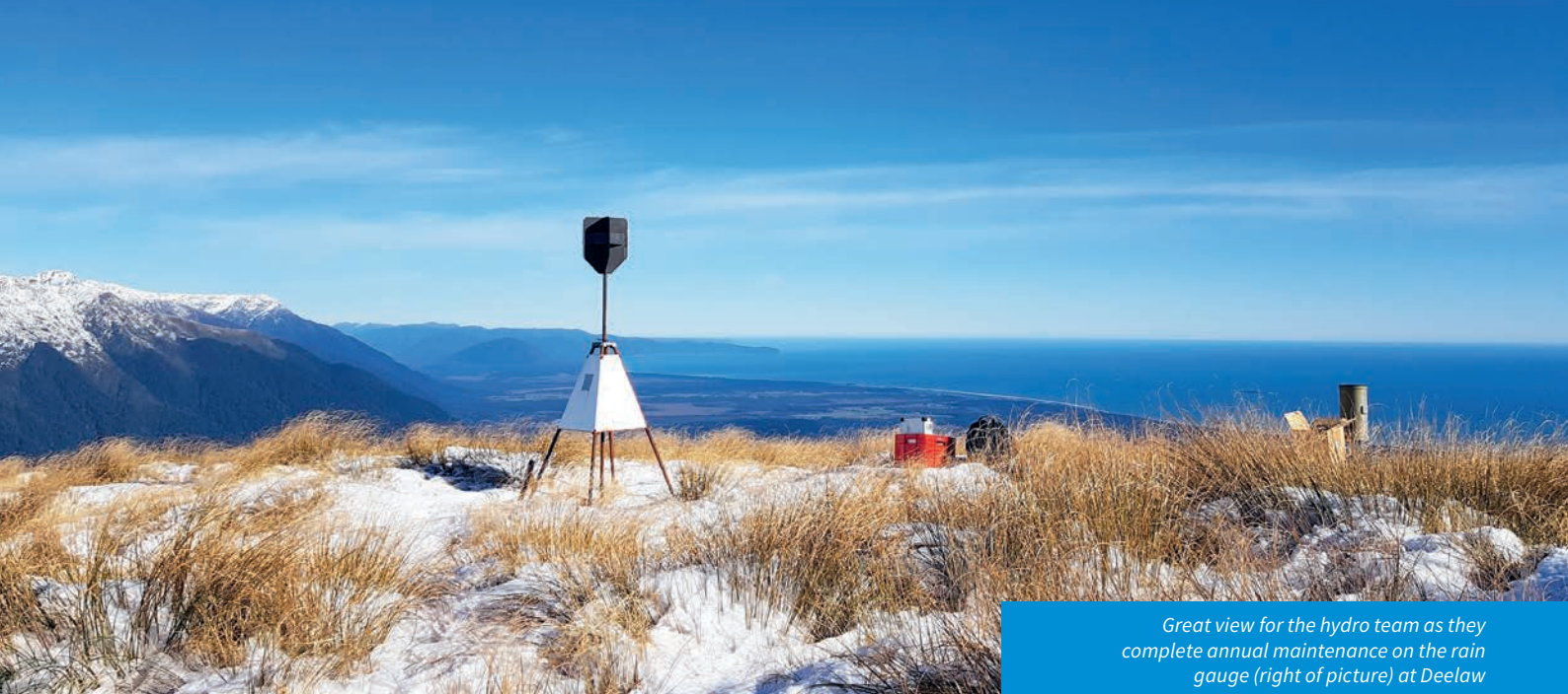
Great view for the hydro team as they complete annual maintenance on the rain gauge (right of picture) at Deelaw